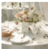
Table Centerpieces 15 Items $100 ✓ $1,500 • Low, beautiful table centerpieces.

Large Entry Flower Arrangements 2 $300 ✓ $600 • Large flower arrangements to place at the entry pillars.